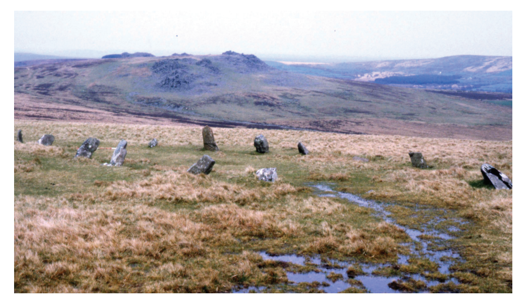
Fig 4. Oval stone setting at Bedd Arthur, north Pembrokeshire, looking southeastwards towards Carn Menyn.