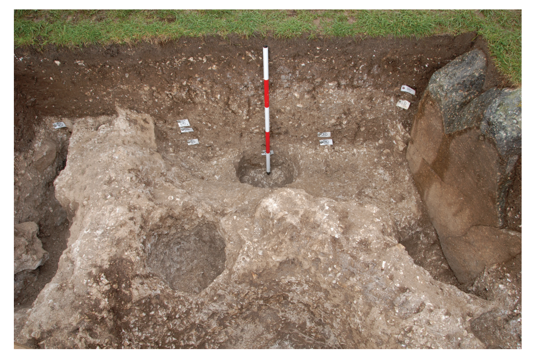
Fig 8. Detail of the south-western section of the 2008 excavation trench at Stonehenge, with Stone 35a to the right and Stone 10 just out of the picture, to the left (1m scale).

Well, as often happens in archaeology, once you start to analyse the material, things change rather drastically. The first analysis we did was to look at the magnetic susceptibility values for the deposits recovered from the cut features. This immediately revealed much diversity in the magnetic susceptibility of adjacent deposits. Generally, the more intense the susceptibility, the more human activity those deposits represent. It is rather an oblique relationship, but none the less it provides a useful indicator. At Stonehenge the magnetic susceptibility levels suggested the heterogeneity of deposits even within single features.