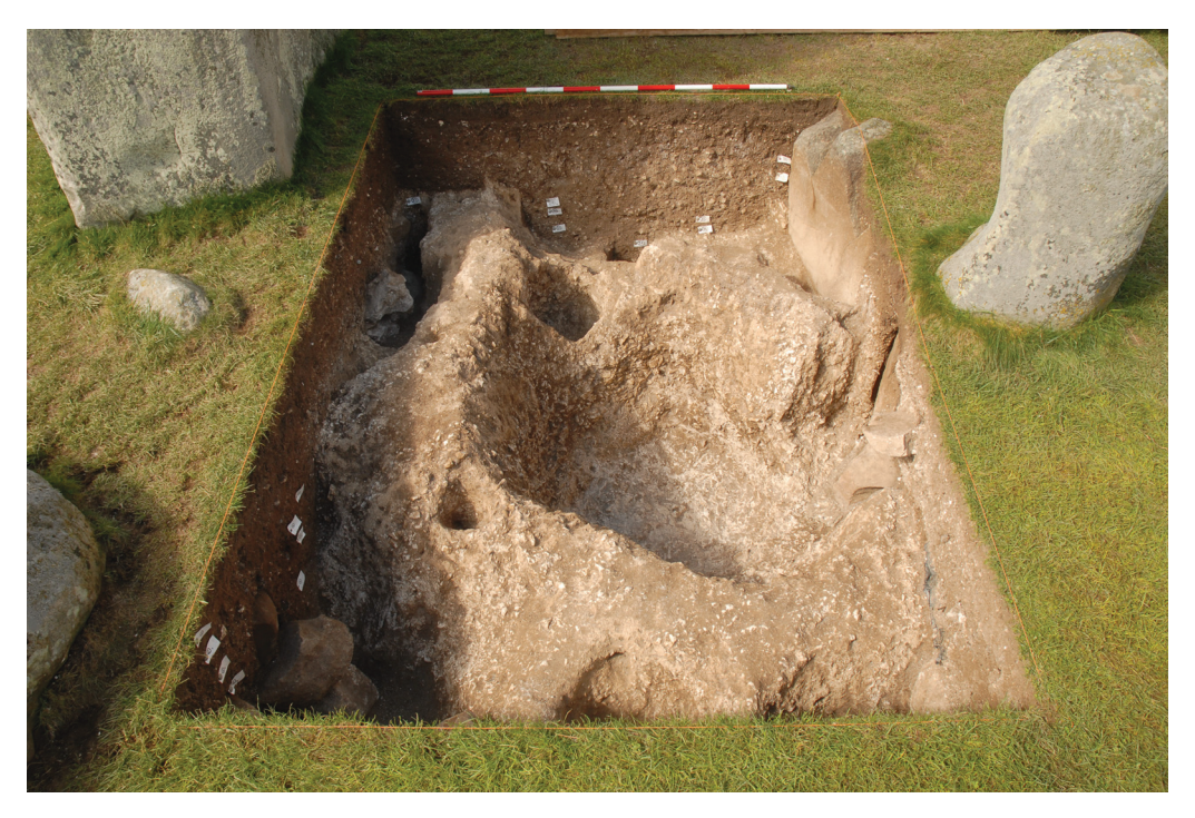
Fig 7. The 2008 excavation trench at Stonehenge with the fills of all identified features fully removed, looking south west (2m scale).

At the time of excavation it seemed to us that the stratigraphy represented the key stages of Stonehenge in what seemed a very familiar pattern of development and evolution. We seem to have what is often called the Phase 2 postholes representing the remains of timber structures at the bottom of the sequence, and it seemed to us that the stratigraphy of what followed accorded with what is published about these things. It seemed to us that we could recognize the cut of a Q-Hole at Phase 3.1, in the conventional scheme of things, which would be the first bluestone monument, with its original cut, and then a series of other edges representing the extraction of the stone and the refilling of the feature as a series of deposits.