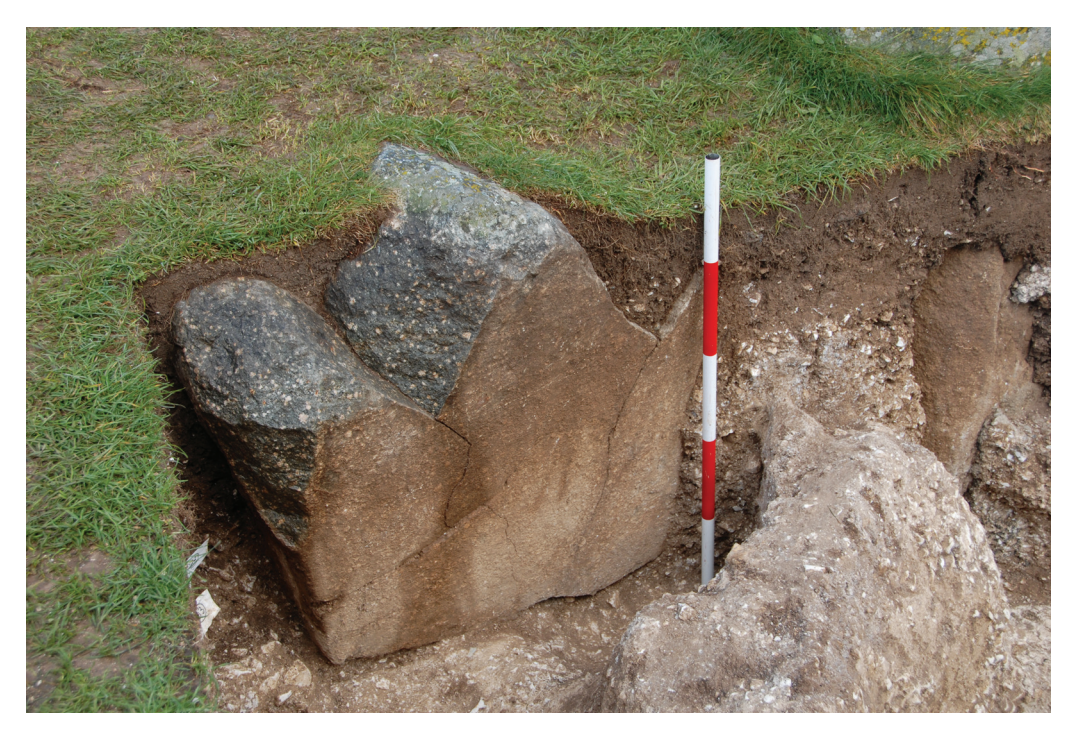
Fig 9. Stone 35a following excavation of its socket and associated recuts. The scale of the buried portion of this stone can be easily seen, as can traces of the way it has been broken up and portions removed (Im scale).

the centre of the circle when they go to visit it. Yet the area between the Trilithons and the sarsen stones is, if you like, a corridor, or an ambulatory around the sacred precinct to use a modern temple as a comparison. The ambulatory is quite broad, like a main street running round the outside of Stonehenge, with a wall of bluestones up the middle dividing it into two tracks. As you walk around this space you are looking into the central area through a series of slits created between the stones of the Trilithons and the gaps between. So while we tend to rush towards the middle of the monument, the business of the site might actually have been in the peripheral area round the edge, where, perhaps, more people could walk and look into the centre than we might first imagine.