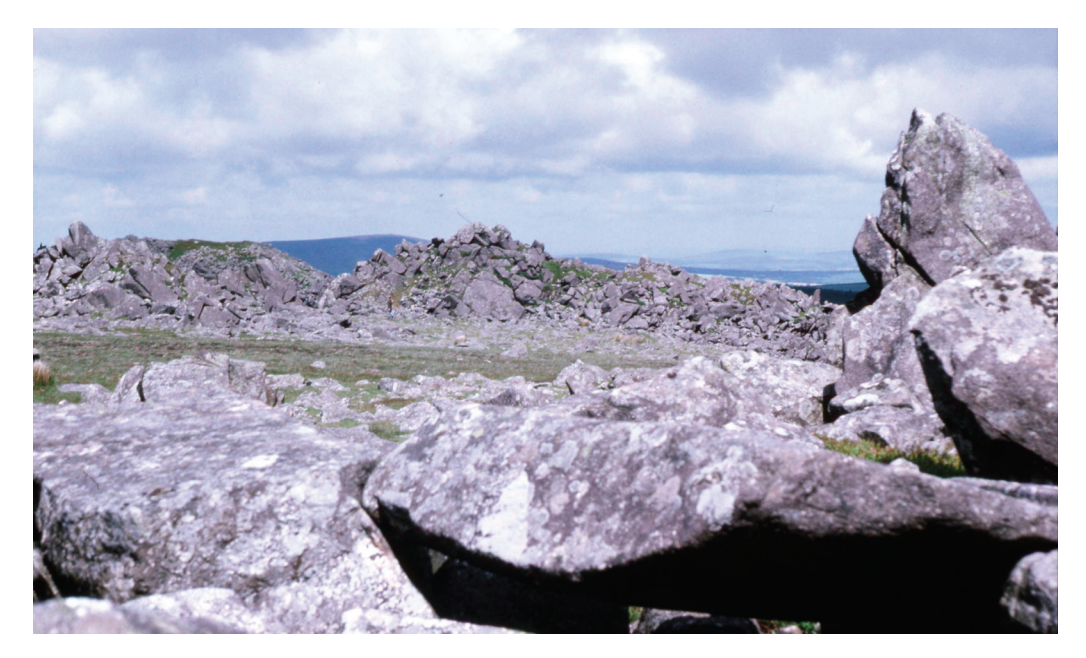
Fig 1. Outcrops of spotted dolerite at Carn Menyn, north Pembrokeshire.