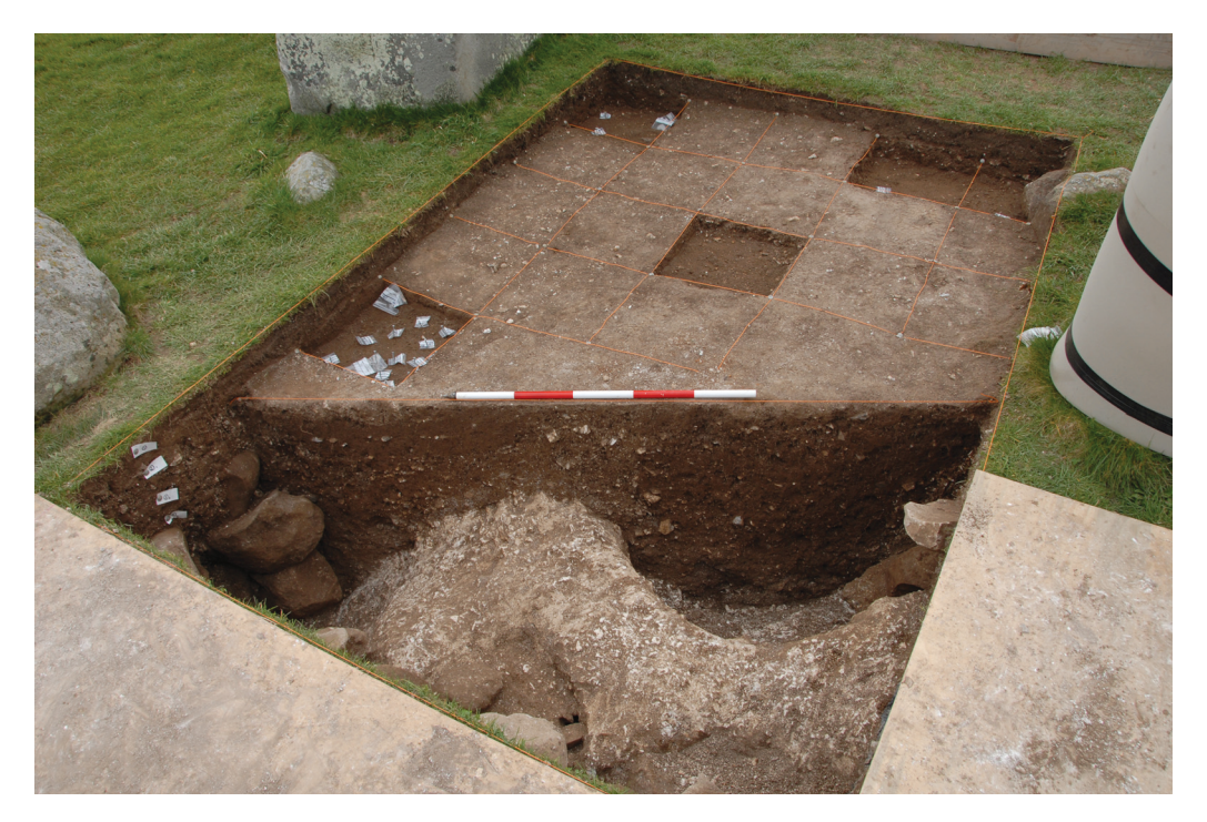
Fig 6. The 2008 excavation trench at Stonehenge following the removal of the backfill from Atkinson's 1964 trench; work has started on removing sample squares from the Stonehenge Layer in the previously unexcavated area (Im scale).

At that point, we changed from a horizontal plano analysis to a feature-by-feature, context-by-context analysis. Even at this depth there was evidence for animal activity and one burrow was especially visible near the centre of the trench. Removal of the backfill from Atkinson's trench revealed a complicated section that, I am afraid, Richard Atkinson looked at but never recorded (fig 6). In fairness, however, the plans he made of this trench