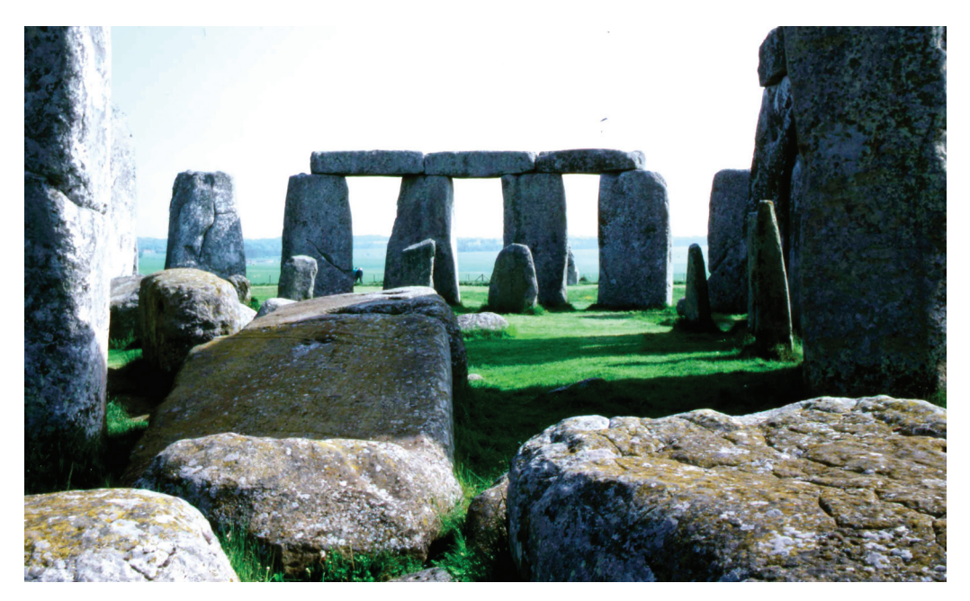
Fig 2. Interior of Stonehenge looking north east, with the remains of the collapsed south-western Trilithon in the foreground, the outer Sarsen Circle in the background and elements of the Bluestone Oval and Bluestone Circle in between.