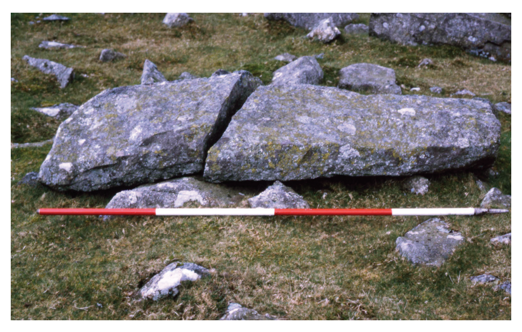
Fig 3. Broken pillar stone below Carn Menyn, north Pembrokeshire (2m scale).