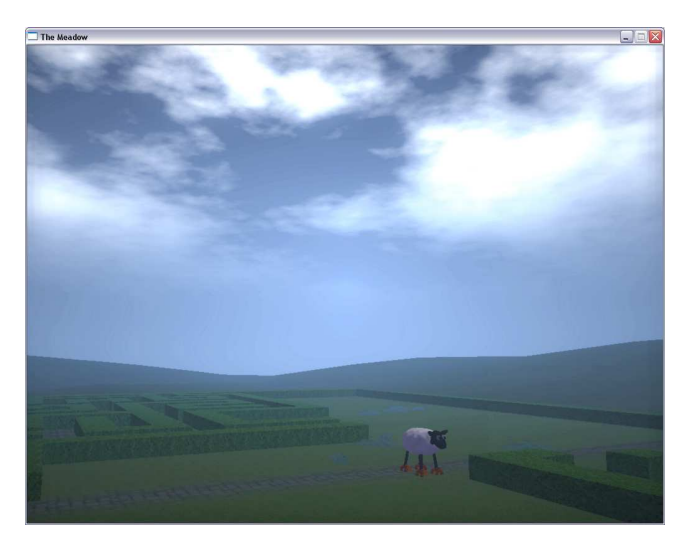
Figure 2: "The Meadow" virtual environment.

ming and to help them realise that computer programming can be an enjoyable task. While many of the availablable systems have been successfully used in the teaching of programming, unfortunately those that are more graphically appealing do not fit our requirements. Their choice of language and programming paradigm have made them unsuitable for our course, prompting us to develop our own solution.