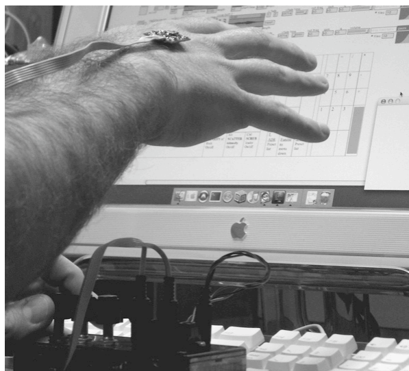
Fig. 1. Photo of prototype Sonic Swarm Controller.

The rotation of the joint of the wrist and vertical movement of the right hand, controlling the spatialisation of the sonic swarm, is mapped using Max/MSP to different parameters affecting the individual agents/sound files. The right hand outputs only 3 streams of data at any given moment coming from the 2-axis accelerometer measuring tilt attached on the wrist of the operator and the infrared sensor measuring distance on the vertical axis. The idea is that the performer is able to interact with the sonic material in a physical way by manipulating a sufficient amount of parameters but without having to control a great deal of sensors. In order though for the device to be expressive and flexible, the performer is able to dynamically assign the 3 streams of data to different parameters at the same time. In this way the same sensor can be responsible for manipulating more than one parameter at once but not necessarily in the same way by using different functions.