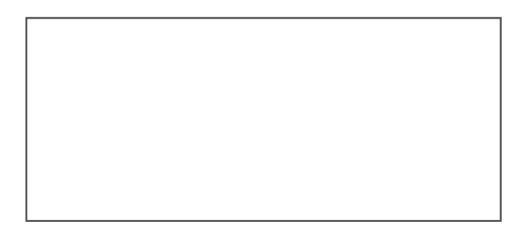
Figure 2: Open Loop heat pump