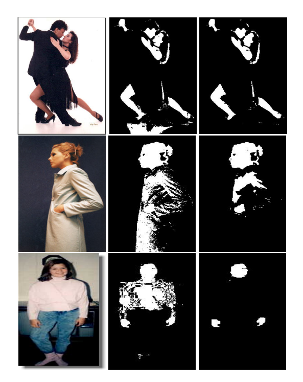
Figure 2: Comparison between pixel-based (Jones and Rehg, 2002) (middle) and region-based with CRF(right) skin color classification techniques.

A region or collection of pixels is called a superpixel. A five dimensional vector is used to extract the superpixels: three RGB color channels and two positional coordinates of the pixel, using the quick shift (Vedaldi and Soatto, 2008) image segmentation algorithm. Superpixels generated from this approach vary in size