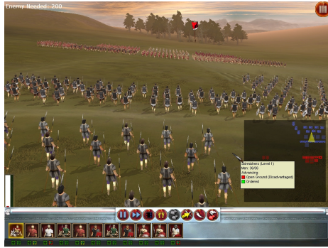
Figure 6: Great Battles of Rome .