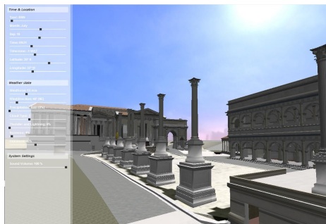
Figure 2: 'Rome Reborn' Serious Game.

The use of visualisation and virtual reconstruction of ancient historical sites is not new, and a number of projects have used this approach to study crowd modelling [ADG*08, MHY*07]. Several projects are using virtual reconstructions in order to train and educate their users. Many of these systems have, however, never been released to the wider public, and have only been used for academic studies. In the following section the most significant and promising of these are presented.