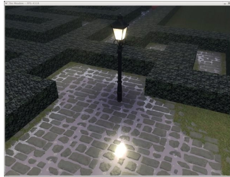
Figure 8: Achieving a mirror effect by rendering the geometry twice [AM07].

framebuffer according to its fourth colour component (alpha). The primary difficulty with this technique is that the results are order dependent, which requires the scene geometry to be sorted by depth before it is drawn and transparency can also present issues when using deferred shading [FM08]. A number of order-independent transparency techniques have been developed, however, such as depth-peeling [Eve01, NK03].