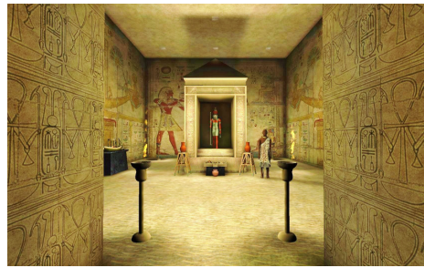
Figure 3: New Kingdom Egyptian Temple game.

The objective of the game is to explore the model and gather enough information to answer the questions asked by the priest (pedagogical agent). The game engine that this system is based on is the Unreal Engine 2 (Figure 3) [JL05], existing both as an Unreal Tournament 2004 game modification [Wal07] for use at home, as well as in the form of a Cave Automatic Virtual Environment (CAVE [CNSD*92]) system in a real museum.