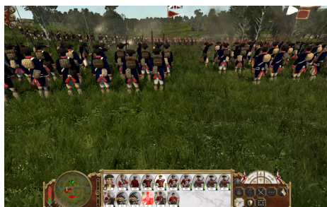
Figure 7: Reliving the battle of Brandywine Creek [McG06].

The use of up-to-date games technology for rendering, as well as the use of highly detailed game assets that are reasonably true to the historical context, enables a fairly realistic depiction of history. As a result, games from the Total War series have been used to great effect in the visualisation of armed conflicts in historical programmes produced for TV [War07].