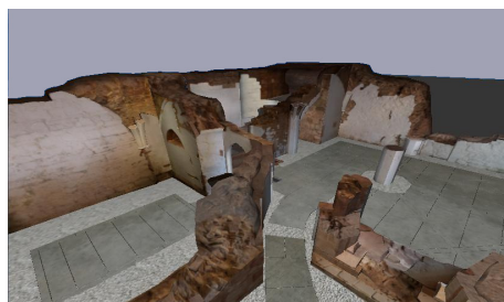
Figure 5: Priory Undercroft – a Serious Game

the game is to solve a puzzle by collecting medieval objects that used to be located in and around the Priory Undercroft. Each time a new object is found, the user is prompted to answer a question related to the history of the site. A typical user-interaction might take the form of: "What did St. George slay? – Hint: It is a mythical creature. – Answer: The Dragon", meaning that the user then has to find the Dragon.