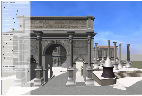
Figure 1: Experiencing 'Rome Reborn' as a game.

This report explores the wider research area of interactive games and related applications with a cultural heritage context and the technologies used for their creation. Modern games technologies (and related optimisations [CD09]) allow the real-time interactive visualisation/simulation of realistic virtual heritage scenarios, such as reconstructions of ancient sites and monuments, while using relatively basic consumer machines. Our aim is to provide an overview of the methods and techniques used in entertainment games that can potentially be deployed in cultural heritage contexts, as demonstrated by particular games and applications, thus making cultural heritage much more accessible.