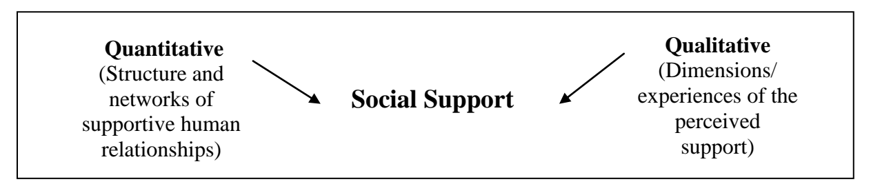
Figure 1. Investigative Approaches to Social Support

A concept contrary to social isolation is social support (Fioto 2002). The literature search yielded two main approaches when investigating social support; qualitative and quantitative approaches as outlined in Figure 1 below.