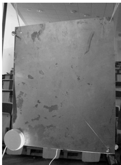
Figure 2. An acoustic node: a metal plate with contact microphone, transducer and string.

As each node is both an acoustic resonator and a device for creating sound, performers can hear the sound as it passes through their node and choose to modulate it or add to it through direct physical interaction with the local acoustic interface. This reinforces the idea of the distributed instrument as a single instrument and affords many opportunities for tactical/tactile interactions between participants who continuously contribute to the overall resonance/feedback of the system.