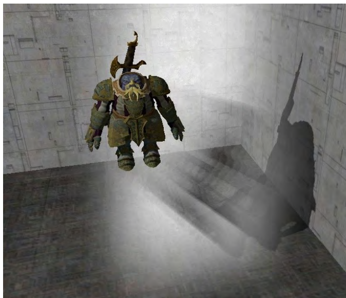
Fig. 4. Initial implementation with external shadowing effect. Artefacts (hard edges) within the 'smoke' are visible.

Fig. 4 shows results using our initial technique. While running at real-time speeds on modern consumer graphics hardware, there are some artefacts as a hard edge appears at the cut-off between pixels located in shadowed and lit areas.