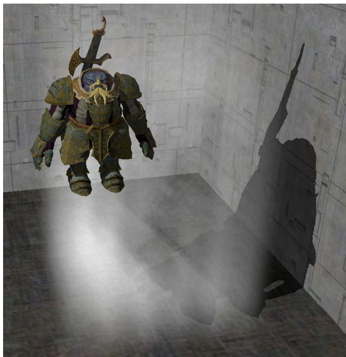
Fig. 5. Final results, including our soft particles (inspired by Lorach [15]), rendered at 124 frames per second on an ATI Radeon HD 5770 graphics card.

Fig. 5 shows results using our improved technique with our version of soft particles. While still running at real-time speeds, the artefacts are significantly reduced.