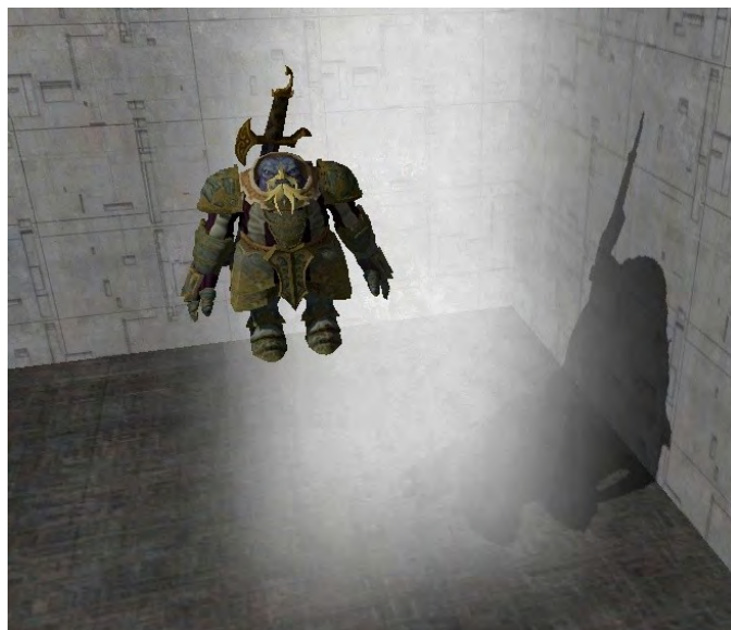
Fig. 1. GPU vertex based ‘smoke’ particle system without any form of shadowing.

A particle system which represents smoke should interact with external shadows from other objects in the scene so as to look realistic and properly integrated into the scene, which it otherwise would not (Fig. 1). Most methods for self-shadowing of particle systems require particles to be sorted along an axis so that the opacity and shadowing information can be accumulated for each particle in the correct order. This process is computationally demanding but there are optimisations, which can reduce this complexity, e.g. those