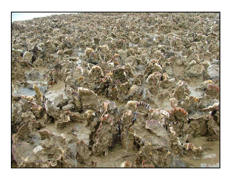
Figure 3. Crassostrea gigas reef, Brightlingsea, Essex.

species discovered in 2014 add to the NW Pacific component of the alien marine fauna in GB. Roy et al. (2014) considered which invasive alien species were most likely to impact on native biodiversity but were not yet established in the wild in Great Britain. Hemigrapsus sanguineus and H. takanoi were both included in the top ten species as posing a 'high risk' (Roy et al. 2014, Table 2) to arrive in the next ten years.