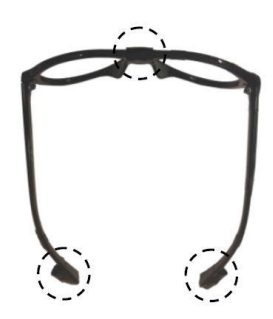
Figure 3. Prototype glasses with the locations of the three vibrotactile actuators illustrated with circles proposed by Rantala et al. [91].

Similar with the success of Google Glasses, wearable technology that represents a hotspot of mobile biometric devices has emerged, including wristbands, smart watches, belts, trackers etc. However, in haptic applications, wearable device is not a new story, such as haptic gloves [88], exoskeleton as mentioned in previous applications, navigation vest [89], devices for gravity sensation [90].