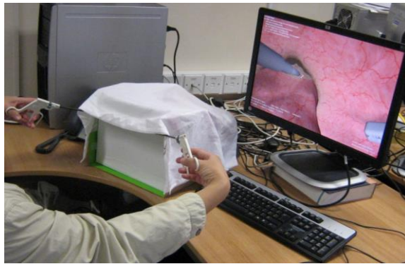
Fig. 1. VR simulator in Laparoscopic Rectum Surgery [13]

A serious game for training on laparoscopic suturing surgery has been presented in [12]. It designed and developed a first prototype for suturing game using a pair of haptic devices. More advanced virtual reality (VR) simulator (see Fig. 1) using double haptic devices has been reported in [13]. Challenges have been raised in simulation of the soft tissues with visual deformation and haptic force feedback with good accuracy.