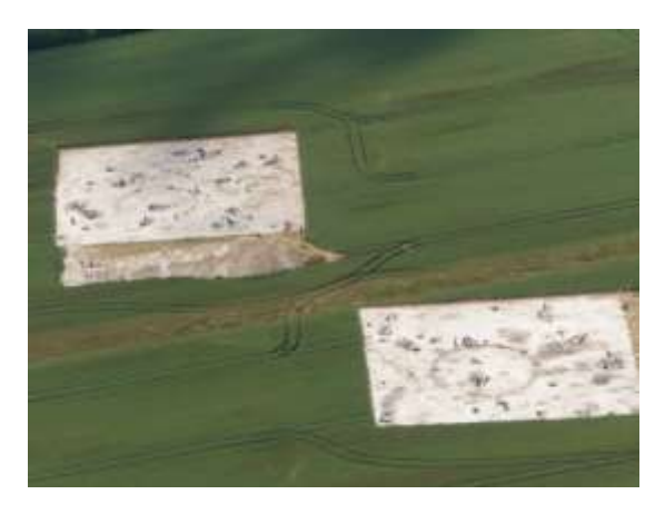
Figure 2: An aerial photograph, looking west, showing the two main areas of archaeological investigation in 2015. Trench A is in the background and Trench B in the foreground (Jo and Sue Crane).

contemporary with the building, although few traces of other internal structuration, such as postholes for the ringbeam, partition walls or lesser forms of furniture, were recorded. It is possible, of course, that such features have been removed through subsequent agricultural attrition.