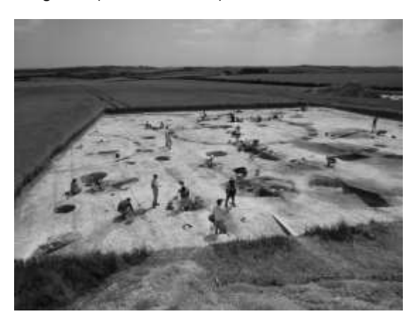
Figure 3: Trench B, looking due south, under excavation in 2015, showing a variety of storage pits and quarry pits together with the foundations of two Iron Age roundhouses (Miles Russell)

In total, eighteen cylindrical pits, measuring between 0.5 and 2.5m in depth, were fully examined within the two trenches, some of which were backfilled shortly after they went out of use and some allowed to weather for a period of time before being backfilled (Figures 4 and 5). As has already been noticed (Cunliffe 1992), especially with regard to the examination of features within the Winterborne Kingston banjo enclosure