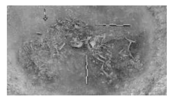
Figure 7: A deposit comprising the articulated remains of three pigs, recovered from the mid-fill of Iron Age storage pit 073. Scale major divisions 10cm (Robin Dumbreck).

Beyond the area of the roundhouse ringgullies recorded, at least seven areas of quarrying and additional activity were