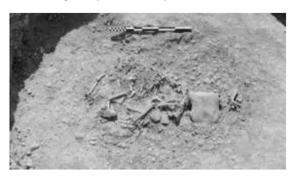
Figure 6: A deposit comprising the articulated remains of a sheep, set down with the skull of a cow recovered from mid-fill of Iron Age storage pit 049. Scale major divisions 10cm.

clay loomweights, quern stones, upended and perforated pots or the inverted skulls of cow or horse and in one case an articulated horse forelimb extended with cow bone and an associated cow rib. Three of the pits within trench A appear to have received secondary deposits placed on top of weathering cone fills, presumably at some significant time after formal pit abandonment. One deposit comprised the articulated remains of a sheep, set down with the skull of a cow placed directly against its posterior (Figure 6), a second consisted of the fully articulated remains of three pigs, presumably all killed together and buried within pit fill as an offering (Figure 7). After these placed deposits were put in either at the bottom or in the mid-fill the pits they were then sealed by fully backfilling the pit in one operation.