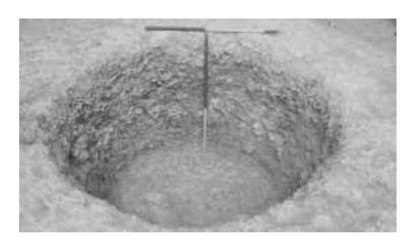
Figure 4: Iron Age storage pit 512 after excavation and clearance. An example of an unweathered pit backfilled immediately after it went out of use. Scale divisions 0.5m

(Russell et al 2014, 219), the term 'storage pit' is traditionally applied to such features when discussed in the archaeological literature, although no definitive evidence as to the nature of storage has yet been found. Presumably, if purely functional in purpose, the pits may have been designed to hold a particular type of foodstuff, such as dairy produce, in the manner of a cold store, or grain, with perhaps each pit or silo storing the surplus produce of a single agricultural cycle. A frequent form of pit combination similar to ones found at Gussage (Wainwright 1979) comprising a larger pit and a smaller directly conjoining, shallower pit observed in both trenches.