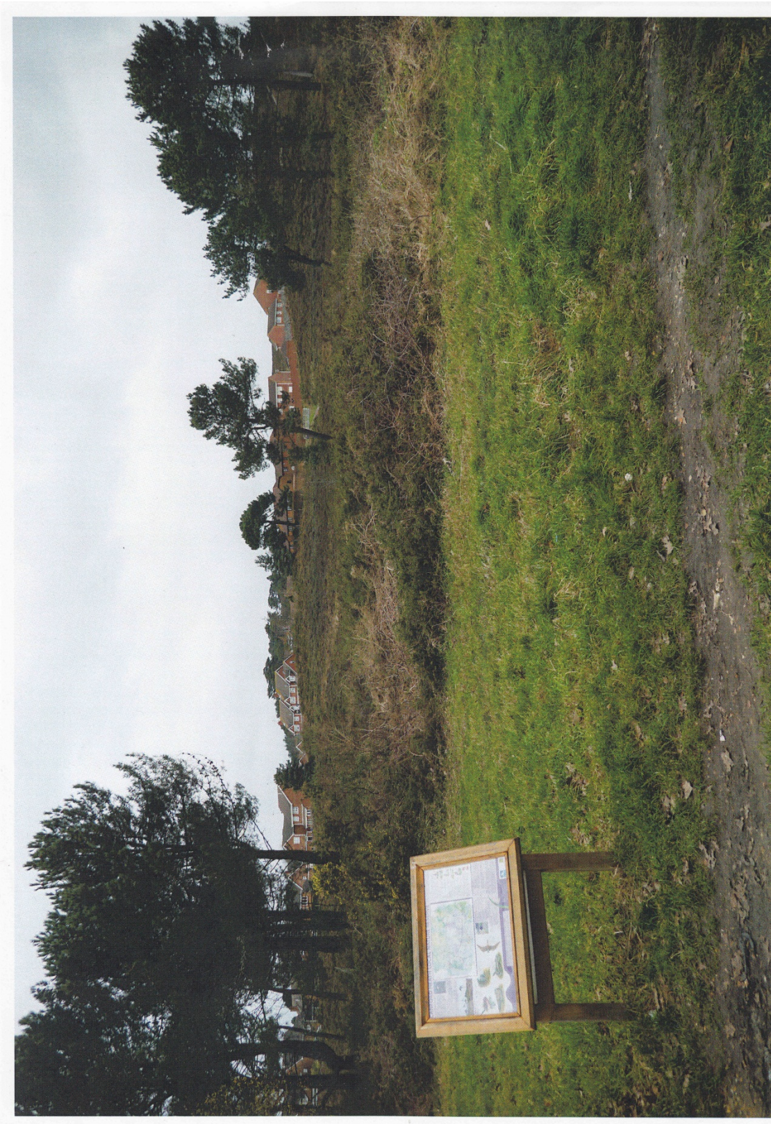
Figure 1-1 Photograph series 1 - Countryside adjacent to urban development SZ 030949