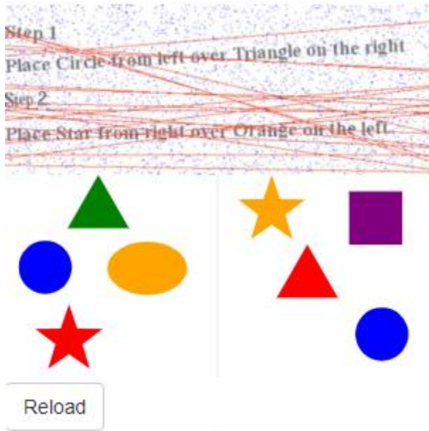
Figure 3: TAPCHA Multi demonstration