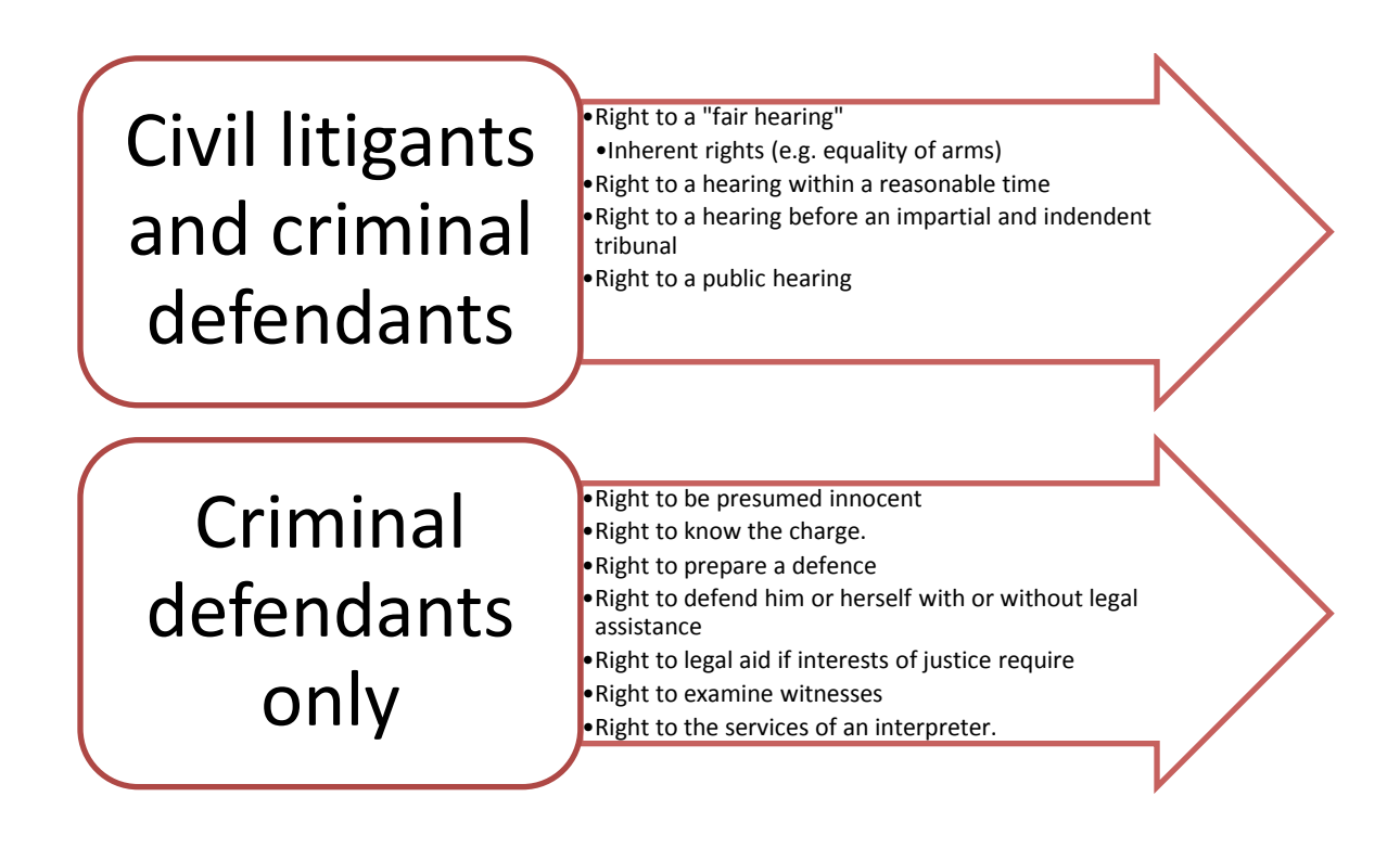
Fig 7.2 summarises the rights of civil litigants and criminal defendants.

Having considered the kinds of hearing to which article 6 applies, we now should discuss the content of those rights.