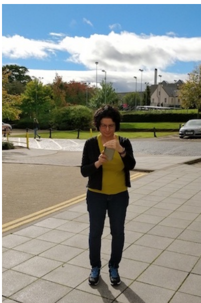
Figure 1: A person trying to use their smartphone while under bright sunlight.