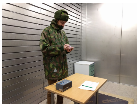
Figure 2: A person completing smartphone tasks in a cold chamber.