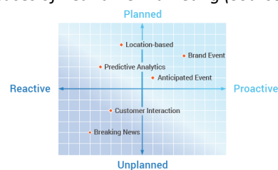
Figure 1: Six Use Cases of Real-time Marketing (Source Lieb et al., 2013)

However, delivering the right content to the right consumer at the right time, especially on unplanned circumstances, is a lot more complicated than merely listening and creating expected service based on data. It is caused by each consumer's unique and dynamic personas based on their location, the chosen activity or purpose of the activity that should be considered by brands before executing any action (Girish, 2016). Thus, understanding consumer's behaviour motivations, preferences and desires against all elements of their internal and external context at a granular aspect is considered paramount. The relevancy and effectiveness of service can be achieved by complementing real-time data mining of consumer's online journey with contextual and situational factors that may affect their motivation and expectation, in order to meet the demand of highly personalised products