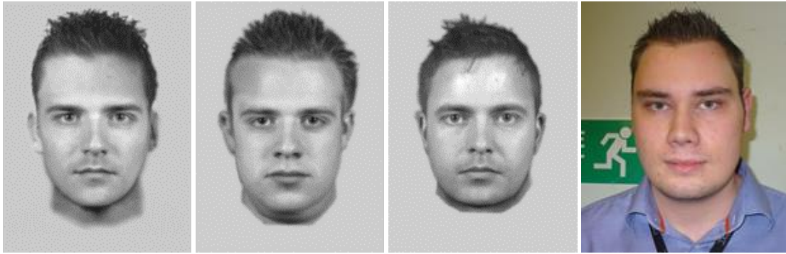
Figure 2. Example composites constructed from a holistic system of one of the targets (far right) used in the experiment. Each composite was produced by a different participant 22-26 hours after having watched a video of the target person giving directions to a local town centre. From left to right, the composite was produced without providing a description of the face (no-description), after freely recalling the face (description no-delay) and 30 minutes after free recall (description delay).