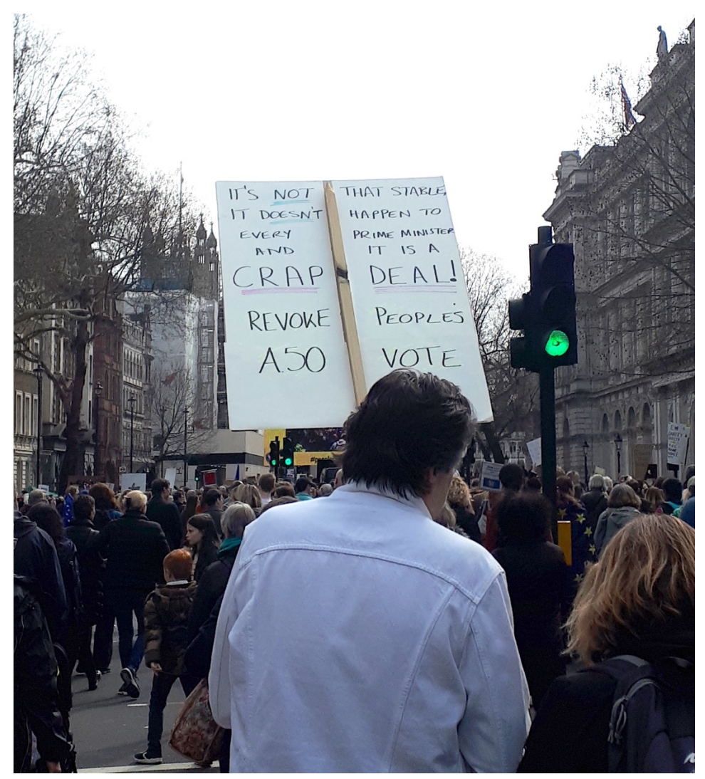
Fig. 2: Sign referencing American sitcom Friends seen at the Put It To The People march, London, March 2019.

question "Do you want to be left alone on a small island with these men?" This alludes to both the obvious fact that Britain is an island, and insinuates that being left alone with these men would be a disappointing and potentially non-consensual sexual experience.