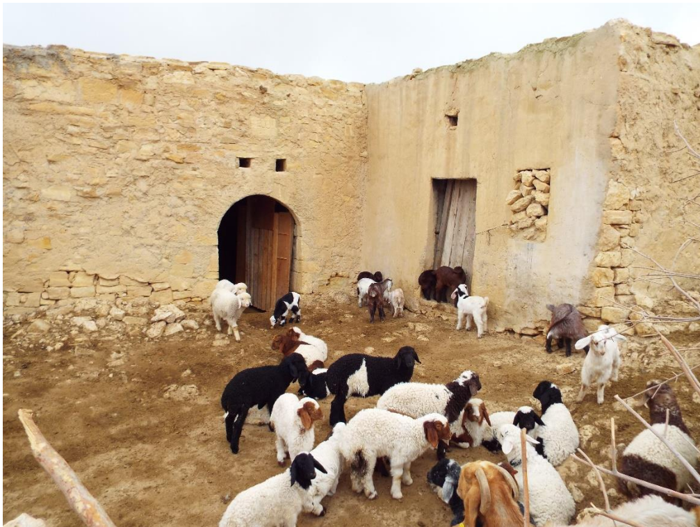
Figure 3: Domesticated sheep and goat in a temporary winter pen in Al Ma'tan, Jordan.