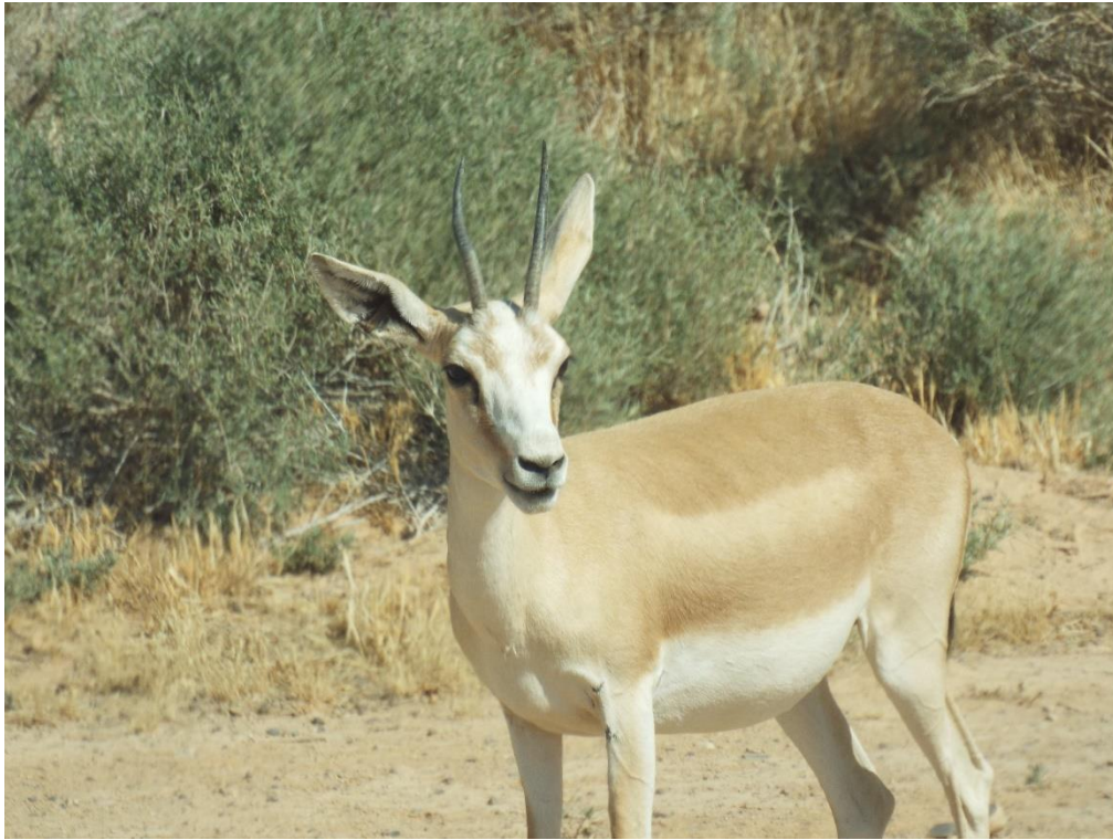
Figure 4: Wild gazelle, RSCN Shaumari nature reserve, Jordan.