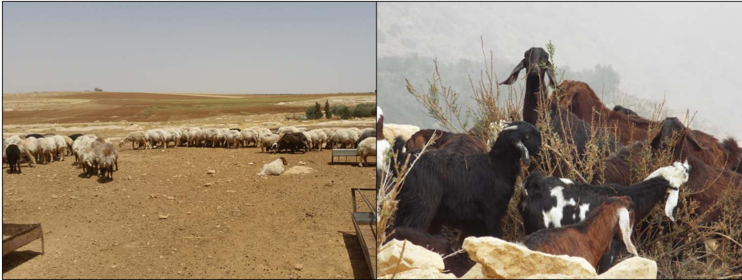
Figure 5: Left: Sheep and goat grazing in the summer near to Adir (Karak), Jordan. Right: Goat grazing on Chenopodiaceae in the winter near to Al Ma'tan, Jordan. This Chenopodiaceae is only consumed by browsing animals in the winter because it is poisonous in the summer (pers. Comm, goat herder Al Ma'tan, Jordan).