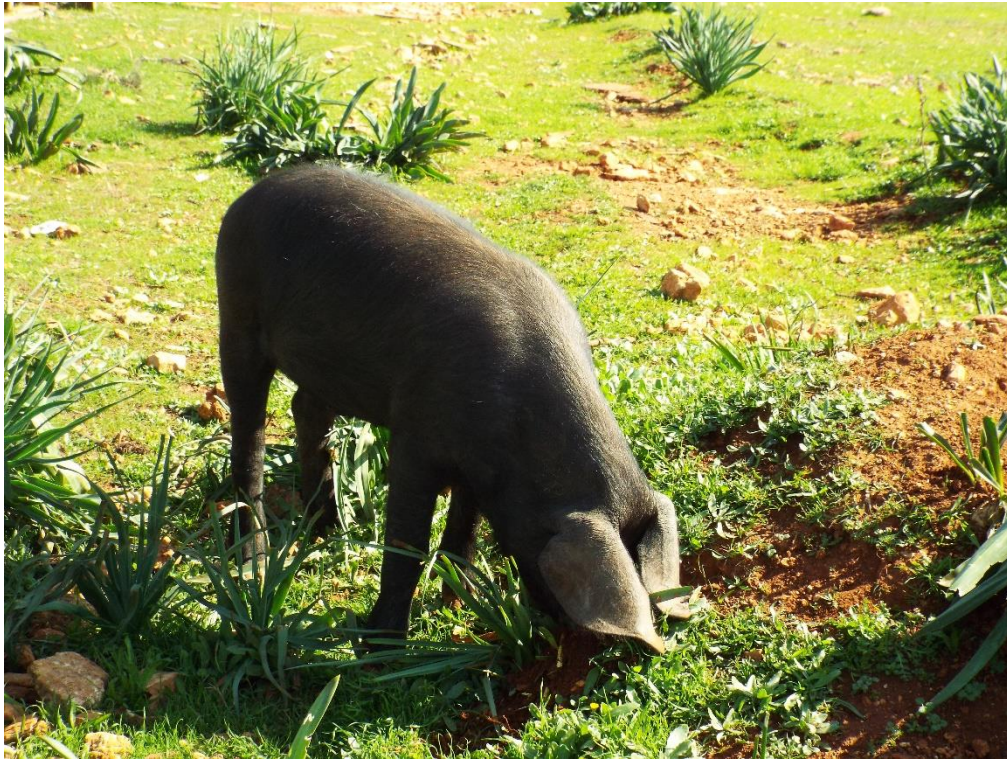
Figure 2: Foraging/free-ranging black pigs near to the Avakas Gorge (Lemba), Cyprus.