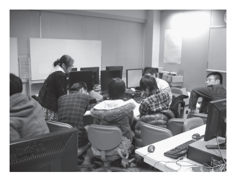
Picture 1 Discussion Scene on the case lead discussion (14 Dec. 2010)

The problem is that there is a shortage of members of the local fire brigade. Most of them are over 60 years old. The members who join the festival under the hot sun and support it, are the ones who can leave their shops safely in the hands of other people. She pondered whether she can join the festival as a fire brigade member next year and how long she can keep going.