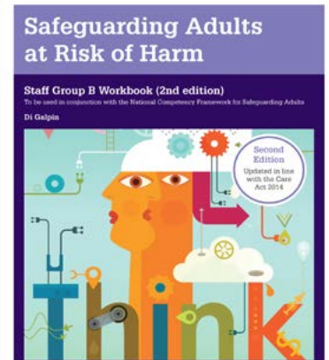
Staff Group B - Updated to reflect the Care Act 2014