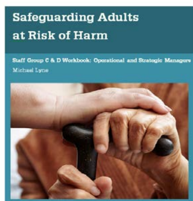
Staff Group C & D