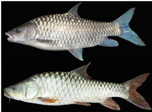
FIGURE 2 The non-indigenous blue-finned (silver) mahseer, since confirmed as Tor khudree (top) and the endemic hump-backed (golden) mahseer, since confirmed as Tor remadevii (bottom); both contributed to angler catches during the study period 1998–2012

2012, only 25 hump-backed mahseer were captured in the fishery and all but five were over 40 lb (18.1 kg), with the mean weight of captured individuals increasing from 21.1 \pm 2.8 lbs ( 9.6 \pm 1.3 kg) between 1998 and 2006 to 59.0 \pm 2.7 lbs ( 26.8 \pm 1.2 kg) between 2007 and 2012. This reduction in the number of smaller hump-backed fish in the catches suggested a collapse in recruitment (Pinder et al., 2015b).