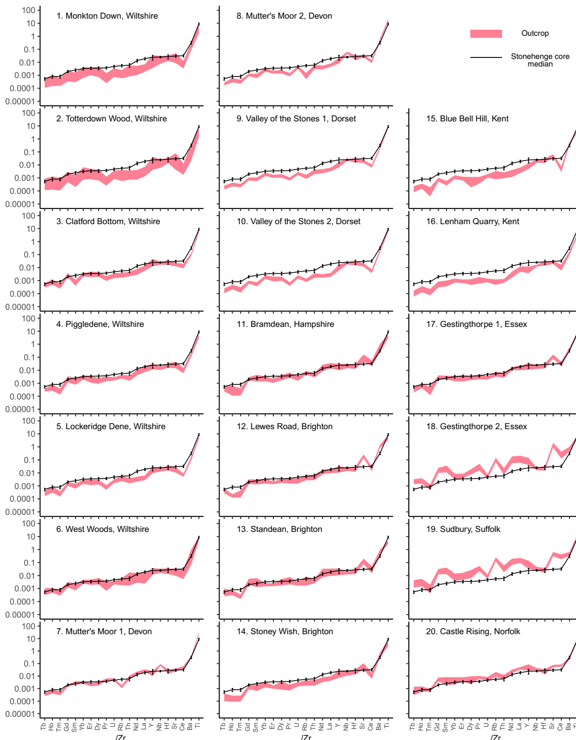
Fig. 3. Zr-normalized immobile trace element ratio data for 20 sarsen localities across southern Britain and the Phillips' Core from Stone 58 at Stonehenge. Data ranges for each of the sarsen localities are indicated by the pink shaded region on each plot. The upper (lower) boundary for each area is defined by the maximum (minimum) Zr-normalized ratio calculated for each element plus (minus) 3 SD of instrumental uncertainty. The solid black line is the median value for each Zr-normalized ratio from the three analyses of the Phillips' Core. The maximum (minimum) error bars represent plus (minus) 3 SD of instrumental uncertainty.