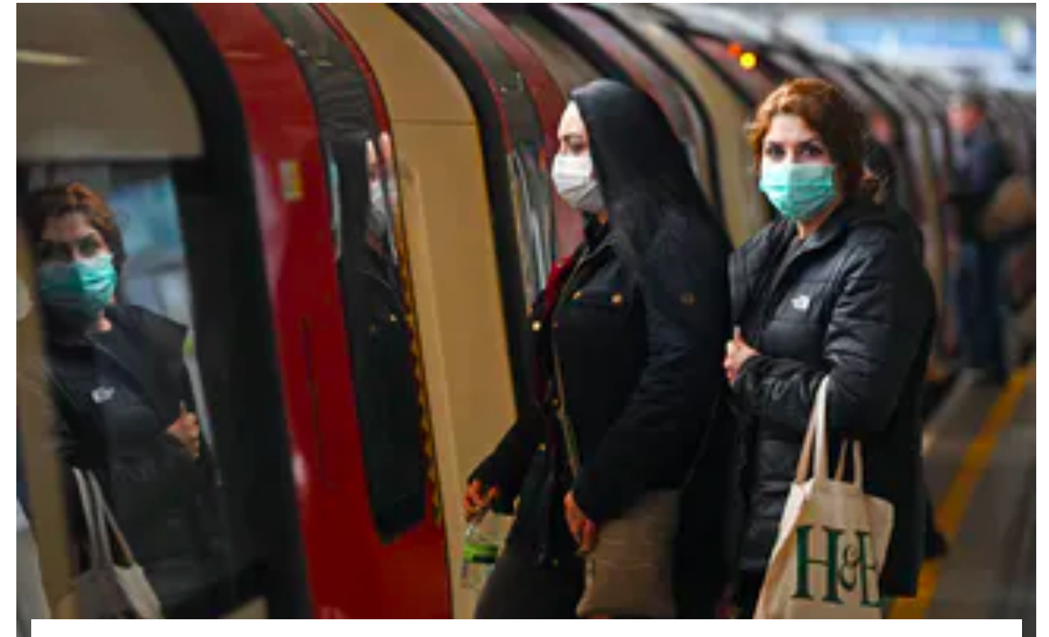
Coronavirus: survey reveals what the public wants from a contact-tracing app