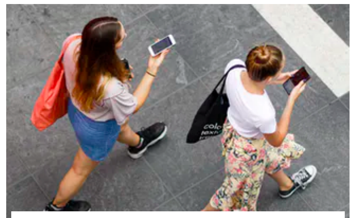
Contact tracing is working around the world – here's what the UK needs to do to succeed too