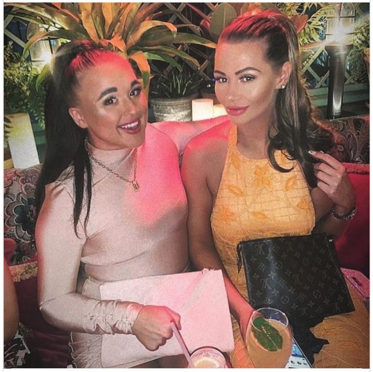
View More on Instagram