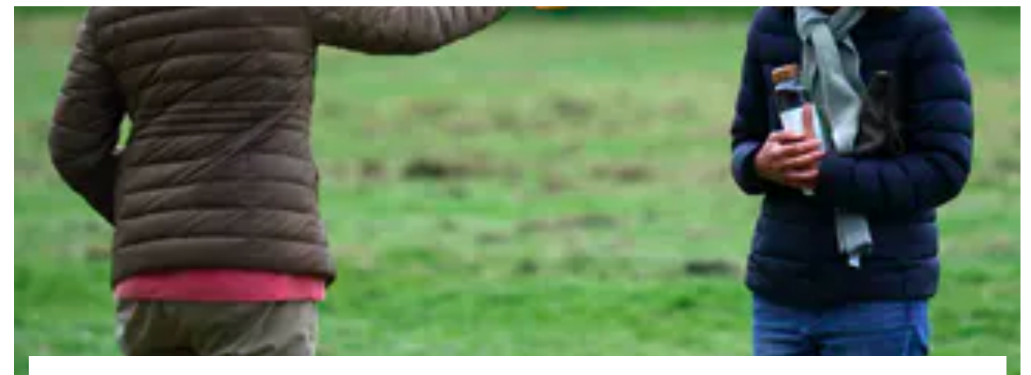
Behavioural science can help make the UK's track and trace app a success - here's how