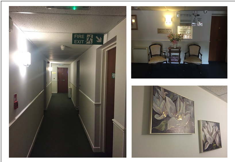
Figure 2. Left is a snapshot of one of the corridors walked along within the development. Upper right is the lobby at the start of the route that participants took. Bottom right is some of the artwork shown along the corridor walls.