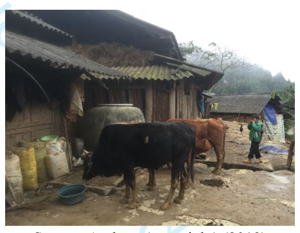
Photo No.1 – A Resourceless Agriculture Peasant Farming (Lao Chai Village)

belongs to the resourceful entrepreneurs (Photos no. 3 and 4), while the other sector belongs to the resourceless entrepreneurs (Photos no. 1 and 2). The photographic findings also emphasise the photo composition in terms of the focal points of the research phenomena, namely, resourceless and resourceful economic agents in Vietnam. In addition, no techniques were used to fabricate the image. The photos used natural light (outdoor environment) without flash. The photographic structuralism conveys a clearer meaning of the dichotomy between the resourceless and resourceful economic agents along with widening the income gap (Table 4) in Vietnam under the CPV's propaganda, complementing the findings of the qualitative survey of a dualistic economy reality.