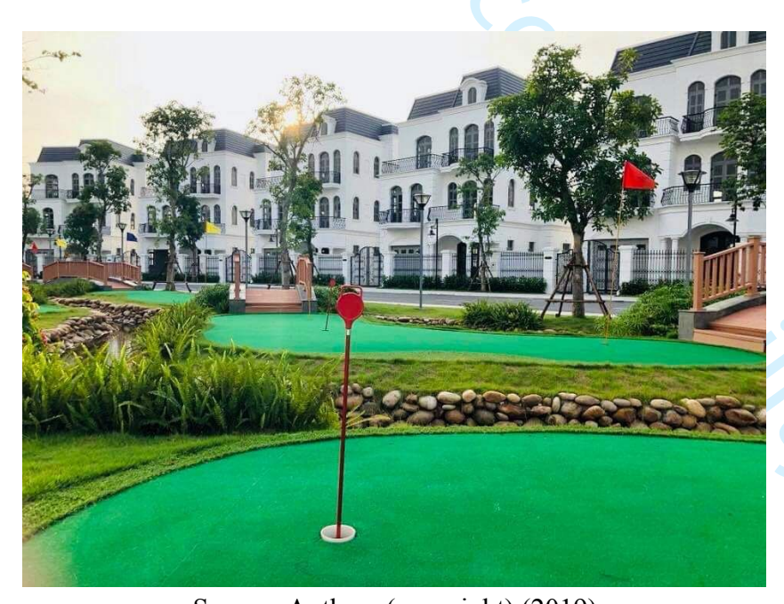
Photo No. 4 - Resourceful Entrepreneurs – Real-Estate and Golf Businesses (Hanoi)