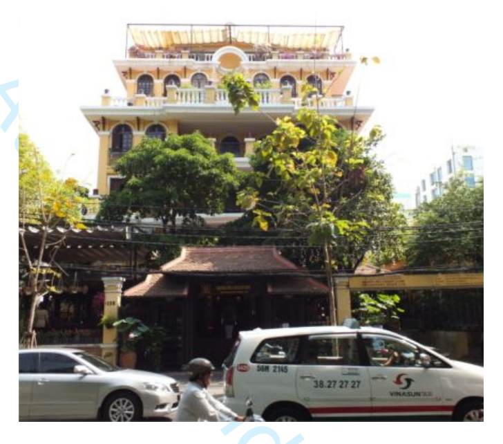
Photo No. 3 – Resourceful Entrepreneurs - Taxi and Chauffeur Businesses (Hanoi)

Contrastingly, the rich were resourceful economic agents operating in the metropolitan cities in Vietnam such as Hanoi, as well as in the surrounding industrial zones, which were created as an extensive investment destination for multinational businesses (Photos no. 3 and 4).