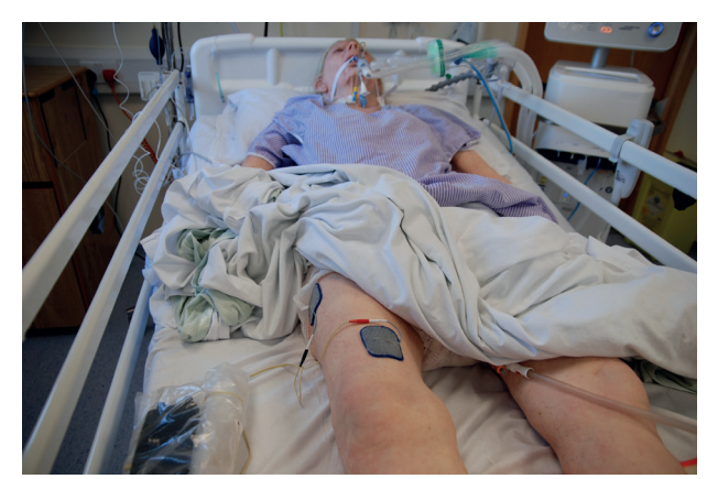
Fig. 1. Electrode positioning for electrical stimulation of the quadriceps (posed with a mannequin).

The application of NMES to treat ICUAW is well documented within the evidence-base (15–18). The primary objective of interventions has been to induce intermittent muscle contractions with electrical stimulation to minimize the loss of muscle mass and excitability, to strengthen these muscles and to enhance the recovery of mobility during and after discharge from the ICU (19). The findings from pre-clinical work on underlying electrophysiological mechanisms from healthy participants and data from critical care patients suggest that, to prevent ICUAW, an NMES programme should begin in the ICU as soon as medically feasible. This is particularly relevant to people with COVID-19, as early intervention is advised due to the often-prolonged