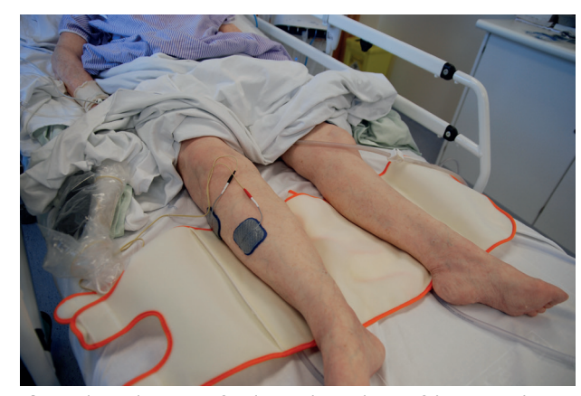
Fig. 2. Electrode position for electrical stimulation of the peroneal nerve for increased blood flow to the lower limb (posed with a mannequin).

NMES has been approved by NICE as an alternative prophylaxis when other mechanical and pharmacological methods of prophylaxis are impractical or contraindicated (47, 48). The transcutaneous application of electrical impulses stimulates the common peroneal nerve to generate dorsiflexion in the lower limb, which, in turn, activates the calf muscle pump, emulating the normal physiological response achieved by walking, without the patient having to mobilize. Electrode positioning is demonstrated in Fig. 2. NMES has been shown to