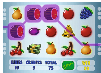
Fig. 1 Examples of near misses and losses disguised as wins (LDW). In the top row , two forms of near misses are presented: ( left ) a 3-reel slot machine with a near miss above the payline; ( right ) a near miss on a 5-reel slot machine (highlighted in black ). In the bottom row , a multiline EGM with 15 playable lines ( left ) is presented and an example of an LDW ( right ). In this example, by betting 75 credits, on 15 lines at 5 credits each, the player's win of 30 is 45 credits lower than the cost of play, presenting as a LDW

on some of the lines, but not enough to make an overall win. The EGM's use of winning sounds and winning animations appear to have a strong influence on a player's urge to continue playing, masking the overall loss (Dixon et al. 2010).