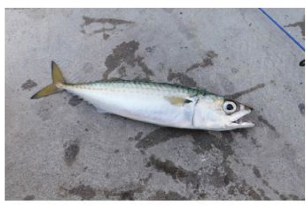
Scomber japonicus (Houttuyn, 1782) Medium pelagic Size: ~30 cm Trophic level: 3.4