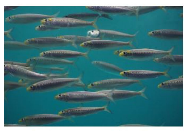
Sardinops sagax (Jenyns, 1842) Small pelagic Size: 10-20 cm Trophic level: 2.8