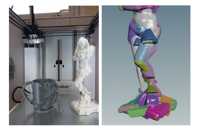
Figure 2: "4D Cubism" project: artefacts produced by Quentin Corker-Marin

[DS12], which focuses on the use of low-cost (open source) off-theshelf solutions for the 3D digitisation of cultural heritage models.