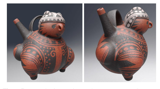
Figure 7: Pre-Colombian Calima Culture (Yotoco period) ceramic pots reconstruction (and repigmentation) by Manuella Nagiel

<sup>13</sup> https://sketchfab.com/3d-models/dancing-faun-2f5dde86328049139e8b62408713d92b