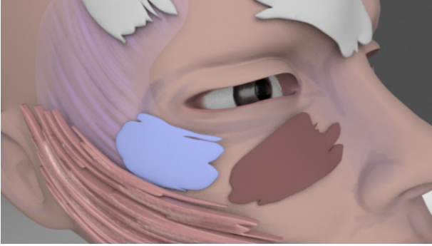
Figure 4: The thick heavily impastoed geometry.

by her studies of raw meat that inspired the colour palette of this piece, especially around the mouth.