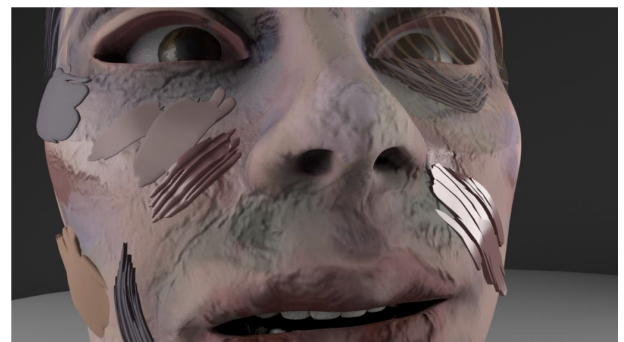
Figure 2: Close-up from our video featuring 3D sculpture with Bacon's and Seville's strokes.

Art studio 'Prudence Cuming Associates' had recreated 'Veil of