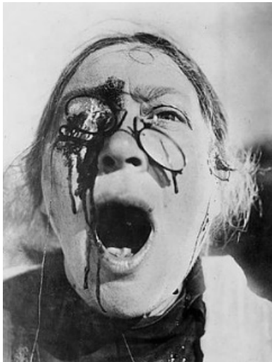
Figure 5: Still from Sergei Eisenstein's silent film "Battleship Potemkin", (1925).

After some initial testing it was found that having a base mesh to add layers onto it would work best for animation as the expression could shift more easily and there was a framework for the fa-