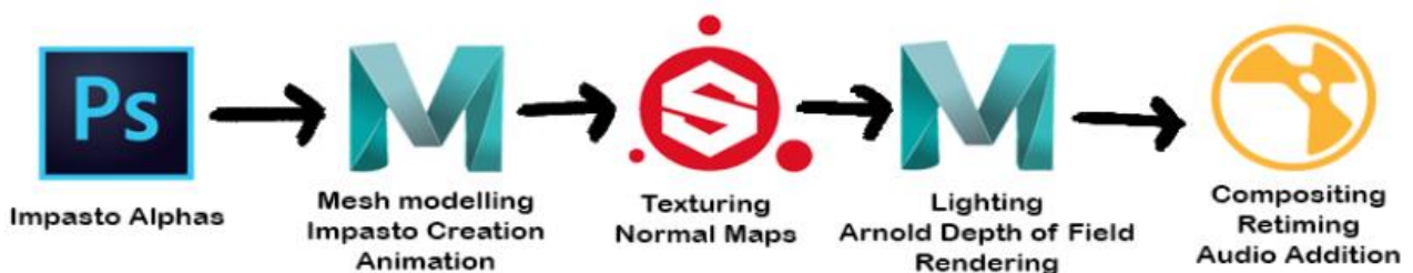
Figure 3: Production pipeline.

Jenny Saville, another modern figurative artist, had inspired the thickly applied blocks of flat colour of the piece. "Stare" (2004-5) [Sav05] is one example of Saville's works that illustrates this. The flat colour piece once again should be translated well into a 3D kinetic sculpture as it breaks up the shapes into simpler shapes that can be more easily manipulated during the animation. Saville's works always feature an impressive range of fleshy tones, produced