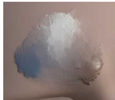
Figure 7: Blending paint using Smudge tool in Substance Painter.

Maya's 'Texture to Geometry' function was used to create impasto mesh from the previously made alphas. The Alphas are created with three different tones; the black sections are deleted, and the grey and white represent the differing elevation of the impasto created. These meshes were then cleaned, extruded, re-topologised, mirrored and smoothed to create final mesh (Fig. 6).