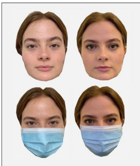
Figure 1. An example of one of the faces depicted with the four conditions of facemask (bottom) and makeup (right). The woman in the picture is twenty years old.