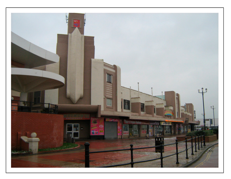
Figure 4. The New Palace at New Brighton (unlisted and facing demolition).