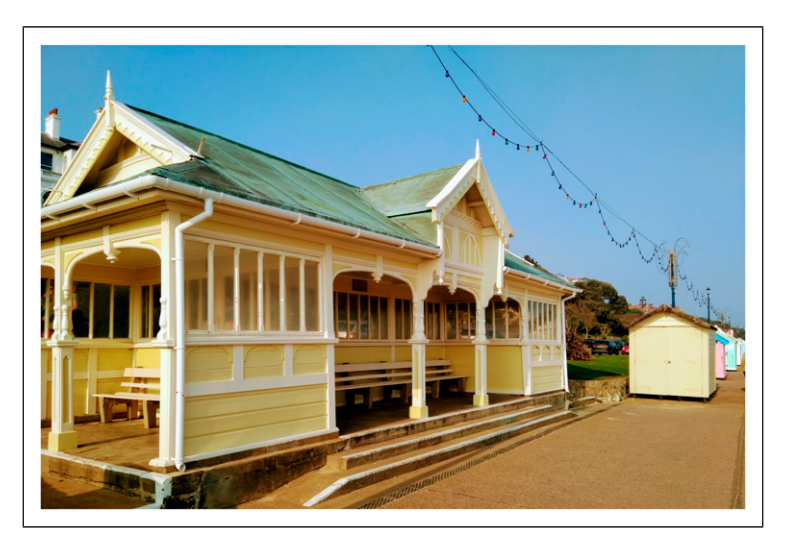
Figure 3. Shelter at Felixstowe.

The trend for modernity continued in the post-War period, with new structures replacing the seemingly old-fashioned Victorian pleasure palaces. Examples include the remodelling of Boscombe pier entrance buildings in a Modernist style, and the Brutalist pavilion at Southsea Clarence pier (see Figure 5).