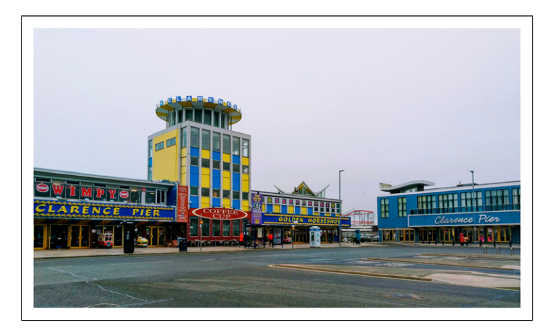
Figure 5. Brutalist architecture at Southsea Clarence Pier.

English Heritage (a charity which, since 2015, has managed a range of historic buildings in state ownership) nor the National Trust owns a single building associated with popular holiday-making at the seaside. Furthermore, relatively few buildings associated with the seaside holiday received statutory protection. In Blackpool – England's premier seaside resort – only 57 buildings are 'listed' and, of these, 31 are associated with tourism and