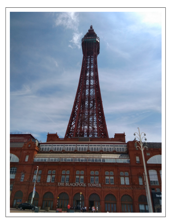
Figure 2. Blackpool Tower.

By the 1930s, the architecture of seaside resorts was again transformed by wider socioeconomic changes. Changing fashions for an active lifestyle, and the increasingly fashionable pastime of sunbathing, resulted in new architectural forms.<sup>18</sup> The ornate architecture of the Victorian era was replaced with the clean, modern lines of art deco lidos, theatres, sun decks, amusement parks, holiday camps, hotels and pavilions.<sup>19</sup> Notable structures opened during this period include Morecambe's Midland Hotel; the 'super cinema' at Dreamland in Margate; New Brighton's New Palace (see Figure 4); Southport's Garrick Theatre; and parts of Blackpool's Pleasure Beach amusement park.