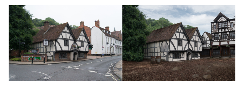
Figure 1: A before (left) and after (right) image of a case-study digital matte painting that forms the basis of the 2D digital painting workshops delivered as part of the course.

The National Centre for Computer Animation, Bournemouth University, UK