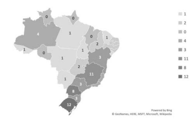
Figure 2: Map of regional distribution of Brazilian GIs<sup>45</sup>

This scenario might change in the future when the number of GIs increases. Currently,<sup>42</sup> there are 79 GIs