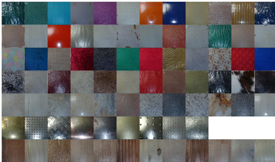
Fig. 1. Photographs of all material samples. Rows indicate different material categories: plastic, paper, fabric, fur and leather, stone, metal and wood, from top to bottom.

Our natural textures consisted of 81 different material samples which were glued on wooden pieces ( 14 \times 14 cm, Fig. 1). These materials samples are the same used by [7]. They belong to seven material categories: plastic, paper, fabric, fur and leather, stone, metal and wood, and were chosen to represent the large variety of material appearances we encounter in everyday life.