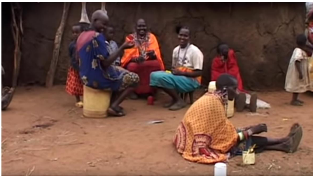
Ouaga Girls (2017)