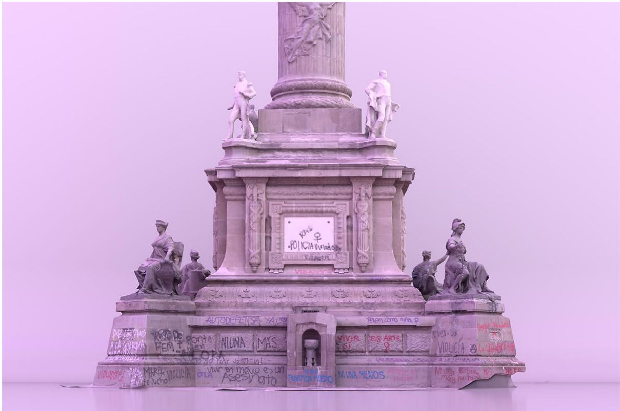
Figure 6: Julieta Gil: Nuestra Victoria - Lumen Prize 2020 Gold Award

collective memory (Halbwachs, 1980) in response to institutional erasure. As Gils states on her website, “The intention was not to make a perfect replica, but to also allow the materiality of this digital version to show through and reveal new layers of information about its process of preservation and restoration and allow the mistakes and imperfections of the scan to serve as a metaphor for the fragility of patriarchal institutions” (Gil, 2020).