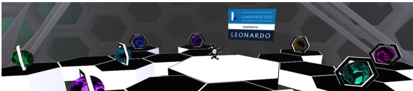
Figure 1: Leonardo Lumen Prize 2020 Exhibition Catalogue Lobby

“In the era of the electronic and digital interface, visibility is not simply an issue of the capture, manipulation, and representation of the visible anymore, nor even one of image literacy and cultural status, but, increasingly, one of display and interface. The question of which images have the power to move us is becoming entangled with that of how we move images, or, rather, how technology allows us to do so” (Beugnet, 2020:2)