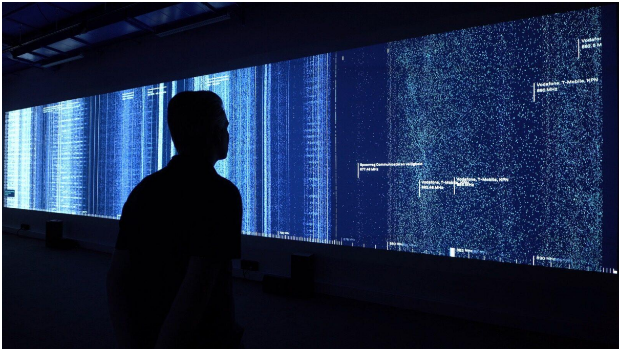
Figure 5: Richard Vijgen: Hertzian Landscapes - Lumen Prize 2020 3D / Interactive Award

this radio-signal landscape by positioning themselves in front of the panoramic canvas, in the physical space as much as in the virtual Lumen exhibition. At the same time, the audience observes the artwork in front of a screen within a screen, submerged into a field of possible inter-mediated interactions within the hexagonal-cellular structure of the Lumen exhibition catalogue.