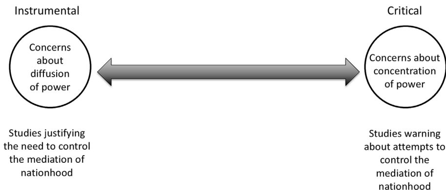
FIGURE 1 Instrumental and critical approaches to nation promotion.

Third, nation promotion assumes that a concentration of power over the mediation of nationhood facilitates identifying the ‘essence’ of a nation, an essence that can in turn be used to achieve political or economic goals. However, as nationalism scholars have long argued, nations and nation-states are characterised by conflict and transformation (Aron, 2019; Beissinger, 2002; Fox & Miller-Idriss, 2008). As Billig (1995) notes, ‘[the] voice of a nation is a fiction; it tends to overlook the factional struggles and the deaths of unsuccessful nations, which make such a fiction possible’ (p. 71). Instrumental approaches consequently neglect the greater participation and diversification of voices within the nation or perceive this diversification as a threat (Lossio Chávez, 2018). They also overlook that states do not act as fixed and coherent entities but draw on an array of roles and responses, particularly during crises (Haugevik & Neumann, 2021).