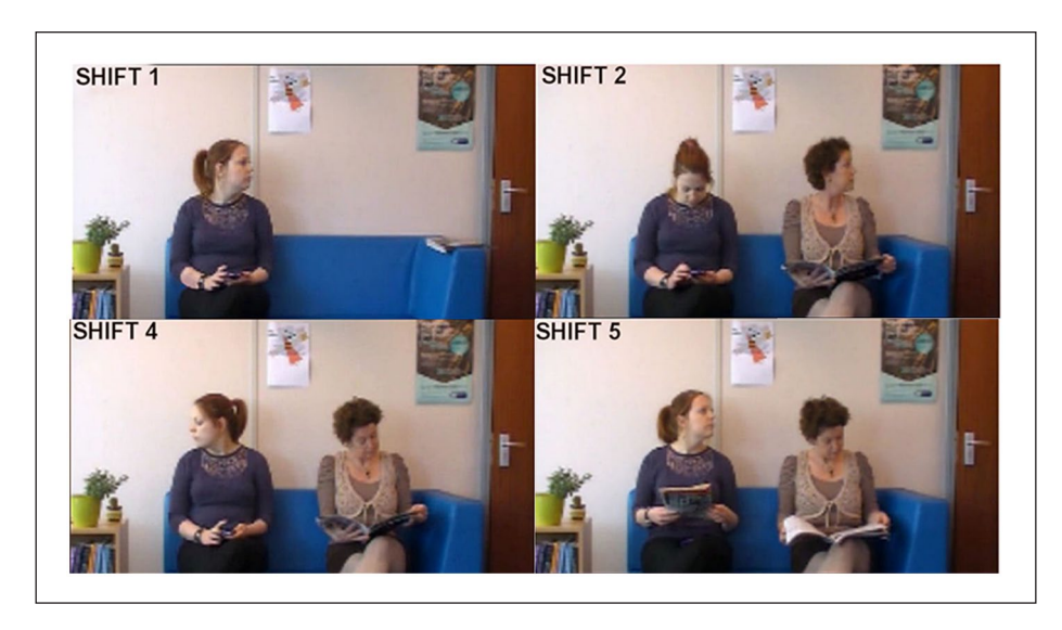
Figure 1. Screen shots of the video used by Gregory et al. (2015) and this study showing the four gaze shifts performed by the actors.