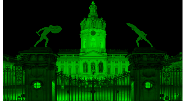
Figure 1: Image from which the distorted holograms were generated, selected from the Div2K dataset as the image with the greatest distribution of black pixels.

To the authors' knowledge this would be the first published work on JND within CGH. The aim of this research is to determine the JND of dead pixels on an SLM used to generate monochromatic,