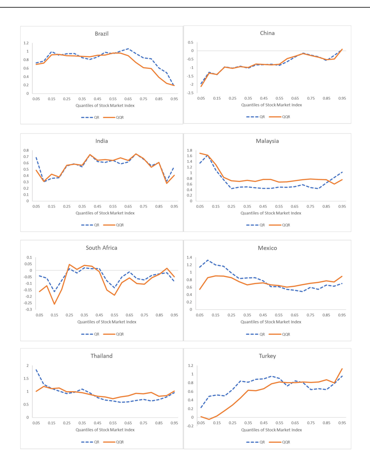
Figure 2. Comparison of Quantile on Quantile Regression (QQR) and Standard Quantile Regression (QQ). Note: Estimations of parameters for standard quantile regression are presented by dashed blue lines. Continuous orange lines present the averaged standard quantile regression estimations at various quantiles of the SMI.