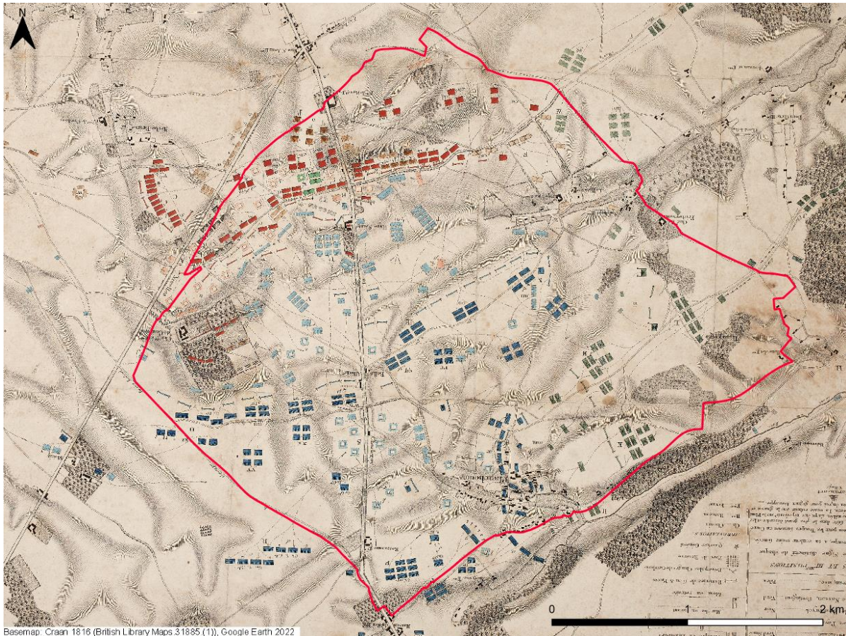
Figure 1 - Map of the battle showing initial troop deployments, produced in 1816, with the protected battlefield area outlined in red. Wellington's Anglo-Allied army (shown in red) deployed along a ridge at the top of the map, with Napoleon's French army in the centre and south (in blue) and Blucher's Prussian forces (in green) approaching the village of Plancenoit in the southeastern corner.

Approximately 100 hectares of the Waterloo battlefield have now been surveyed using fluxgate magnetometry (Sensys MXPDA) and multi-receiver frequency-domain electromagnetic induction (EM) (DualEM 21HS with coil separations of 0.5, 1 and 2m) (Figure 2, Figure 3). Magnetometry was undertaken using a five-sensor array with 50 cm sensor spacing and a 100 Hz sampling rate. Coarser sampling was used for the EM surveys (2 m interline spacing at 8 Hz) to target broader pedological variability and larger archaeological features. These methods were selected for their ability to provide complementary datasets on both magnetic and electric properties at a range of depths and to enable identification of a wide range of potential targets (e.g., hearths and other features related to bivouacs, scatters of metal ordnance, mass graves/cremation pyres, expedient defensive works, and other relevant landscape features such as field boundaries, ditches, structures, and paths).