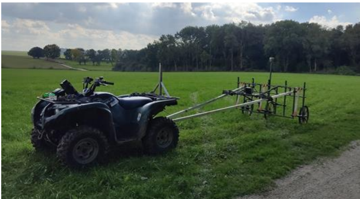
Figure 3 - Magnetometer survey near Hougoumont Farm, Waterloo.

One feature that may relate to the battle was mapped in close proximity to the present-day Lion Monument (which commemorates the spot where the Prince of Orange was wounded). The feature appears as a moderately strong positive anomaly in the magnetometry dataset and is also apparent in the in-phase (IP, magnetic susceptibility) component of the EM data (Figure 4). A sign change occurs in the cumulative IP response between the 1m and 2m EM IP data layers: it presents as a negative magnetic contrast in the shallower coil pair and a positive magnetic contrast in the deeper. This is related to the spatial sensitivity of the IP response of this geometry (Tabbagh, 1986), which can serve as a qualitative means to assess the depth positioning of detected features by their ambiguous response in HCP measurements performed with different coil separations. In this case, the responses