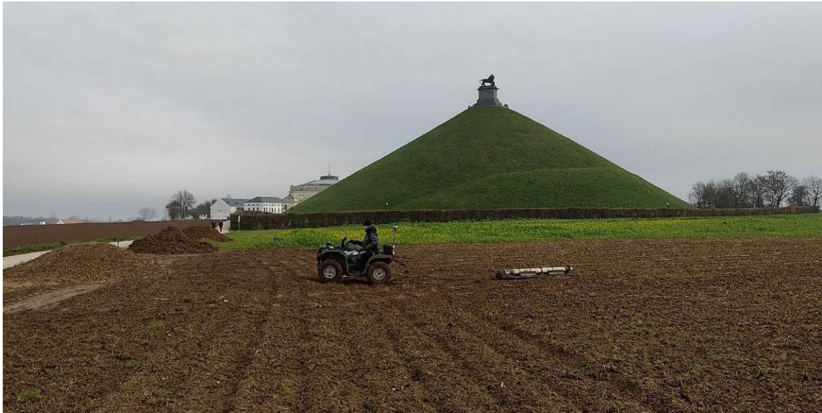
Figure 2 - Electromagnetic induction survey near the Lion Mound monument, Waterloo.