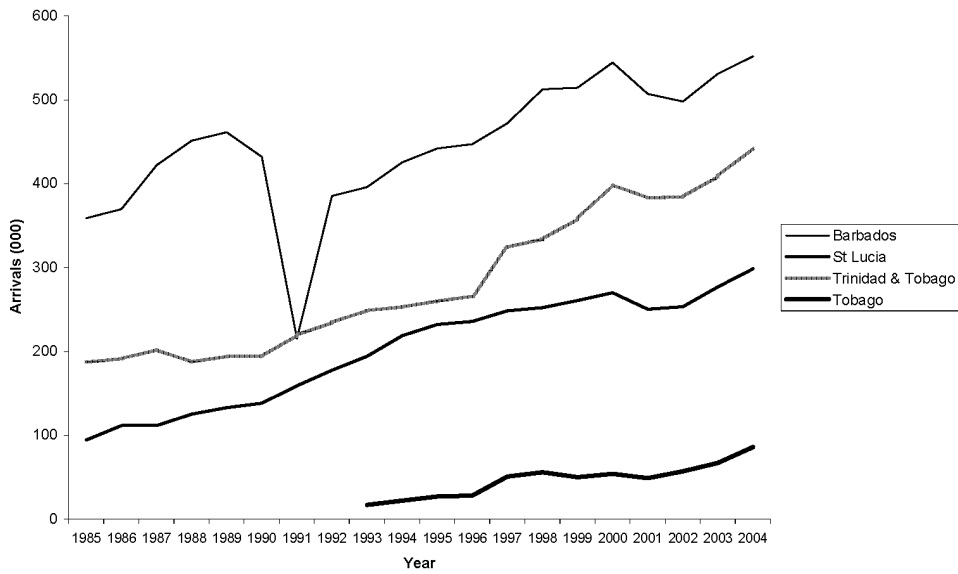
Figure 2 Comparison of Caribbean destinations visitor arrivals 1986–2004