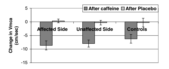
Figure 2. Change in Vmca after tablet—patients and controls (mean \pm 1 SEM).