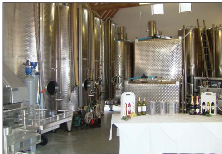
Photo 2. The winery at Wickham Vineyard, Hampshire

with stainless steel from floor to ceiling (Photograph 2). Given that the principal stated objective of opening to the public is as a means of increasing sales, it is not surprising that 82% of vineyards have a tasting area with a third of those stating that this is specifically there to encourage sales. The type of tasting areas varies from purpose built facilities, for example, at Highdown Vineyard in West Sussex (Photograph 3) to the common arrangement of two oak barrels with a sheet of glass resting on top. Many owners feel that a tasting area creates a focal point during the tour and the right ambience for tasting. Tasting allows visitors not only to try new wines, but also ensures that they buy wines they like.