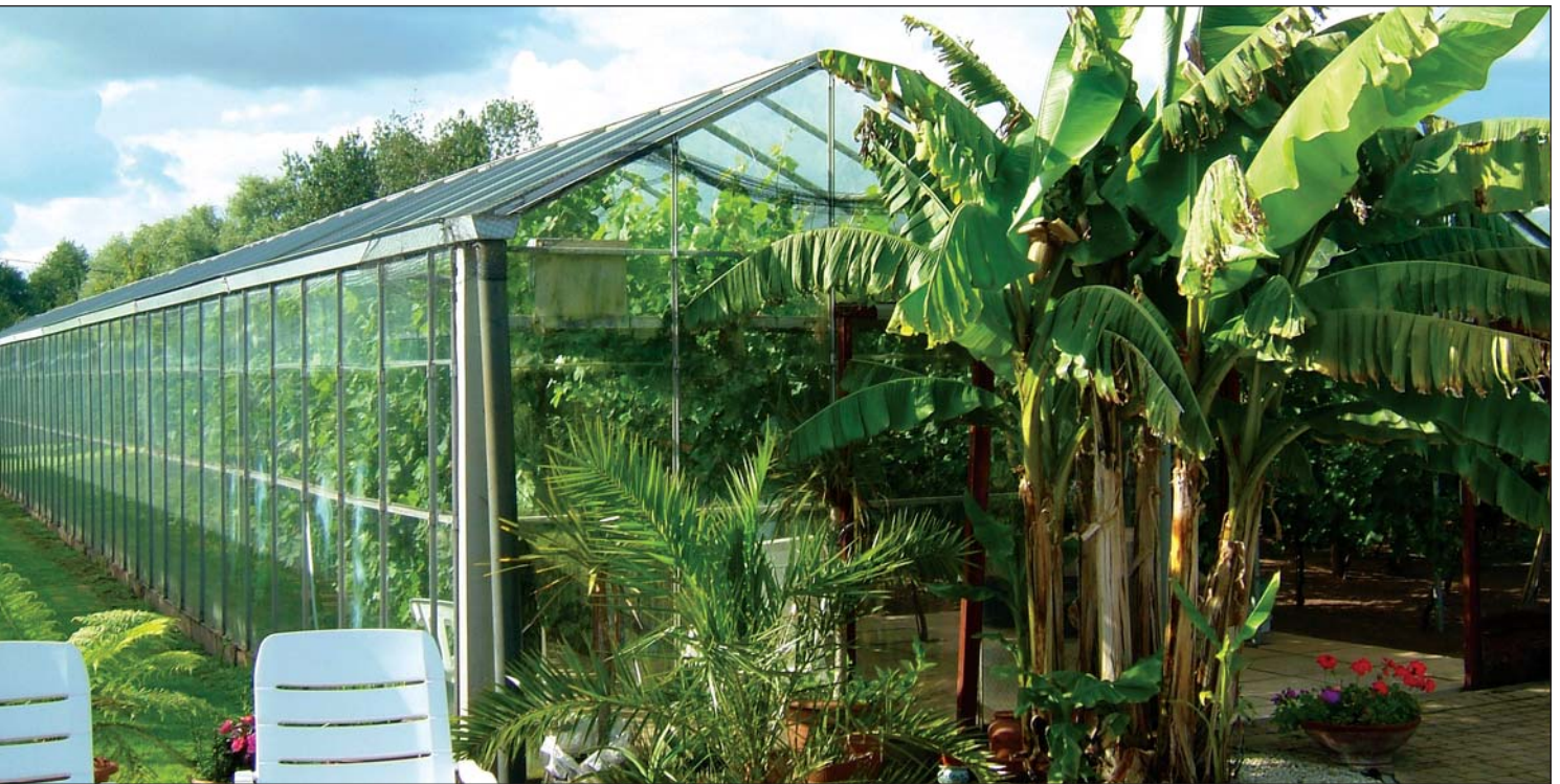
Photo 1. Vines under glass at Strawberry Hill Vineyard, Gloucestershire

additional visitor amenities, such as catering, accommodation or education facilities.