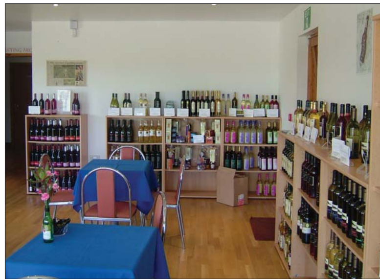
Purpose-built visitor facilities at Highdown Vineyard, West Sussex

In setting out some of the findings of our research I have tried to identify many of the issues owners face in opening to the public. For those, who have already taken this step, there may