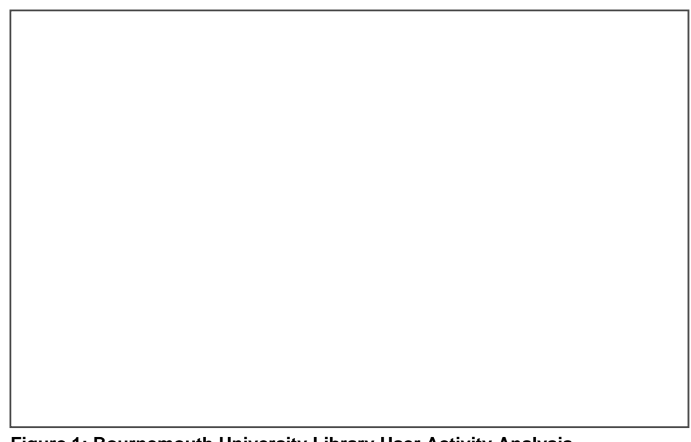
Figure 1: Bournemouth University Library User Activity Analysis

The ability to succeed is the ability to adapt. It's about embracing and leading change, drawing on support from those around you. We must create an active learning environment not only by maximising space but also by ensuring it is sympathetic to the developing pedagogy and to students' expectations.