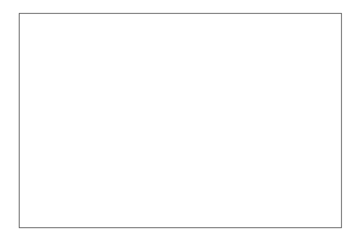
Figure 2: Techno Booths

Attention to detail - for example signing, choice of fixtures, fittings and technology or the introduction of machines for drinks and snacks - considerably enhances the experience of using the library. Background to the choices which underpinned the design is given in the article by Beard and Dale (2008) and images are displayed on the University website.