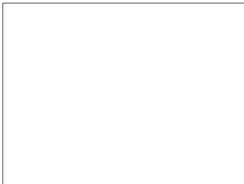
Figure 1: Belhuish House, Dorset. Comparison of RM-15 0.5m and 0.75m twin results with the EM38B quadrature phase results displayed as resistivity. Note the low resistance anomaly one third of the way along the top side of the survey area that corresponds to the position of the known animal grave from 2001.

In conclusion, the work on these sites suggests the EM38B conductivity and earth resistivity systems produced good and compatible results while GPR and MAG produced less consistent but still good results. The only instrument/technique that failed to produce good results the one site it was tried on was the EM31, however, this instrument may well have performed more successfully at the Belhuish House site had it been available for these surveys. Not surprisingly perhaps, these results support the widely held view that individual geophysical techniques do not provide conclusive results on their own, but that by using a combination of various techniques and configurations and comparing the results, the ability to detect and recognize anomalies associated with grave features increases considerably regardless of whether graves are 5 or 40 years old. However, this work does suggest that ER or EM (conductivity) should be there in the first choices of technique, with the ability to also provide magnetic susceptibility and metal detection data an additional advantage in employing EM instruments. -----